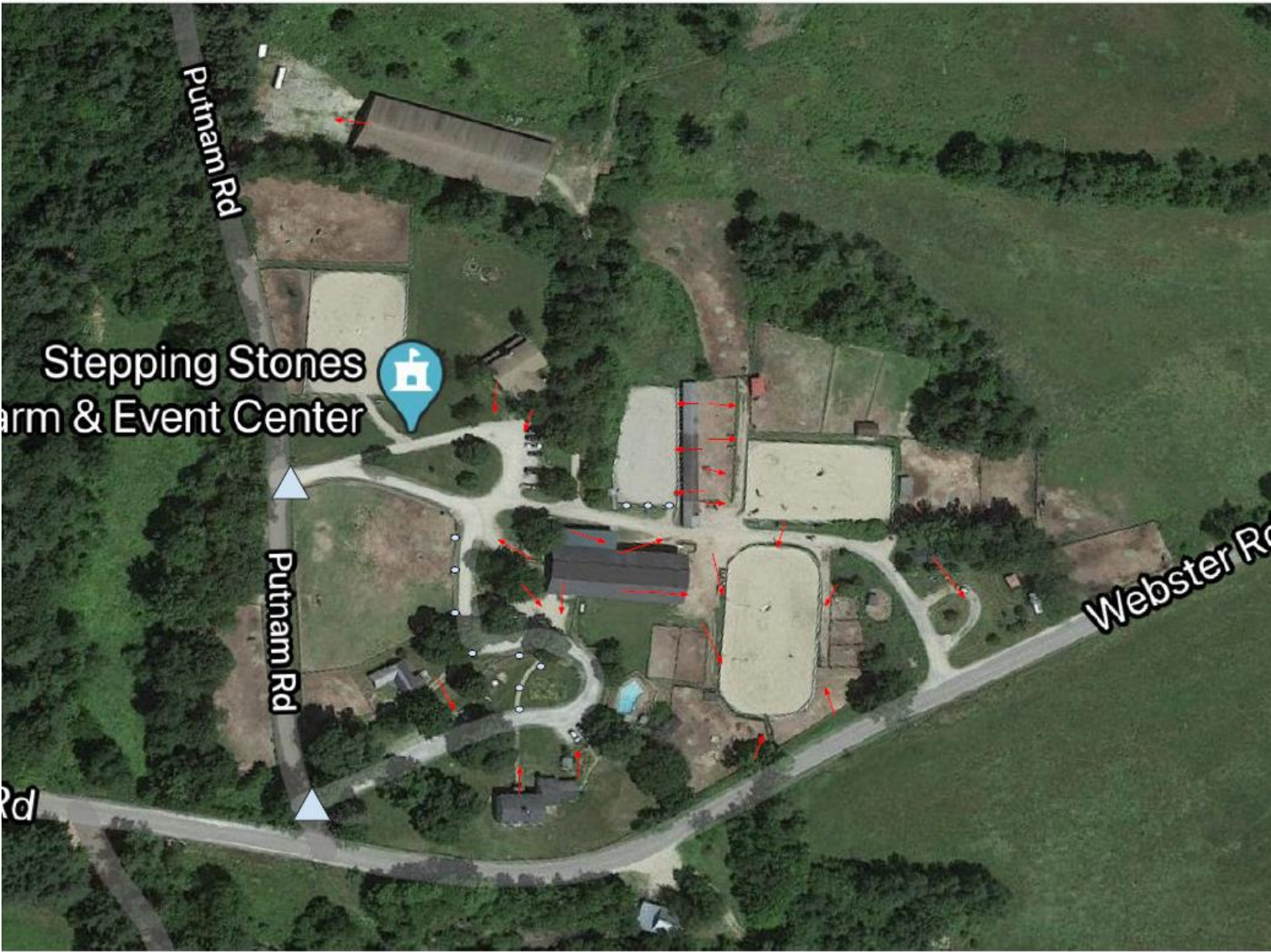
Each red arrow indicates areas that will be lit for parking and pathways with more detailed descriptions below.